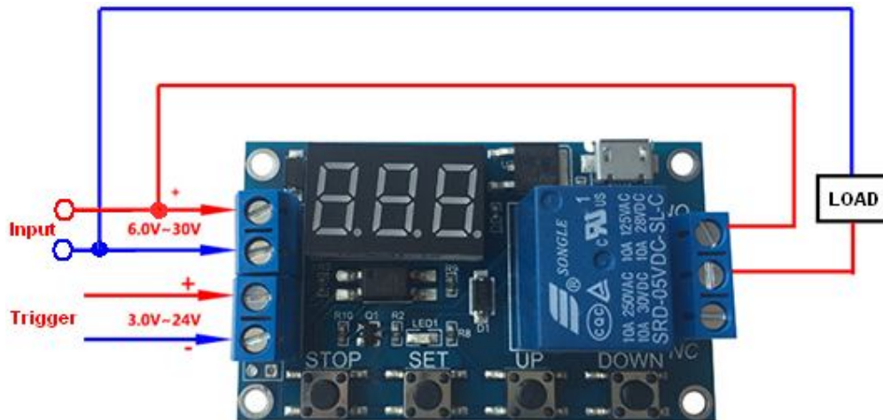
Wiring diagram with shared power source, DC controle